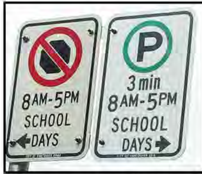
2. No stopping during school hours 3. Park only for 3 mins during school hours