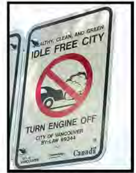
4. Do not idle (turn off engine while waiting)