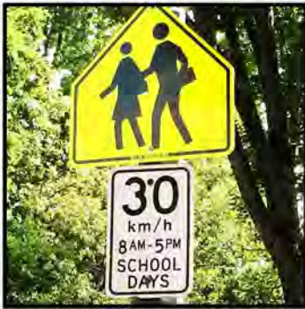
1. School zone. Drive under 30 km/hr